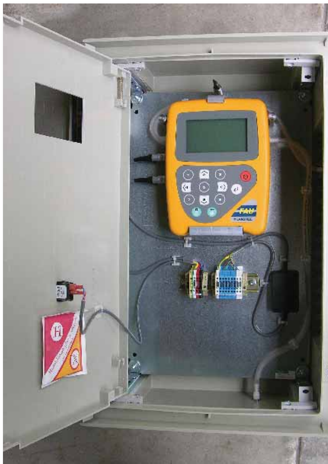
Field analytical unit - The remote gas analysis panel passes data to field server unit

the specific gas channel in the absence of the specific gas being calibrated, then setting a calibration point using a known quality of the same gas. Manual field calibrations are appropriate for portable instruments. Although, many stationary systems allow manual calibration, CDM projects typically require an accuracy that can only be verified with automated calibration