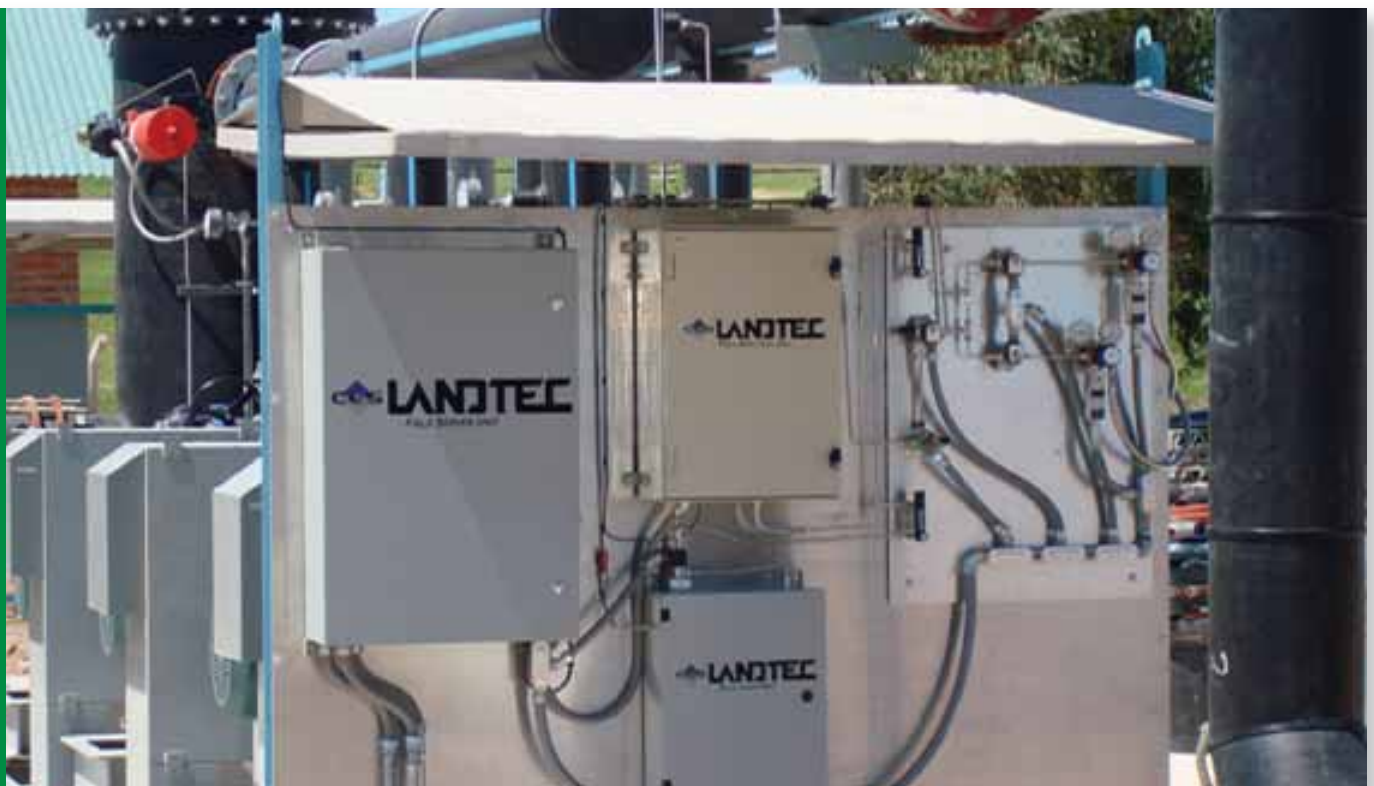
Unmanned and Remote, Automatic Extraction Monitoring System Equipment at Work

In its infancy in Europe, carbon trading is fueling remote and wireless monitoring globally, especially in North and South America. That experience and technology is now finding a demand in Europe.